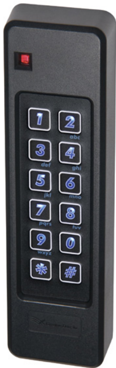
P-620 Denali Mullion-Mount Reader & Keypad

The Farpointe website features a responsive, mobile-friendly layout that automatically adjusts to the screen width of the device being used.