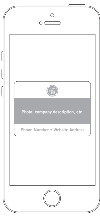
Example Credential Back

Farpointe Data reserves the right to change specifications without notice.