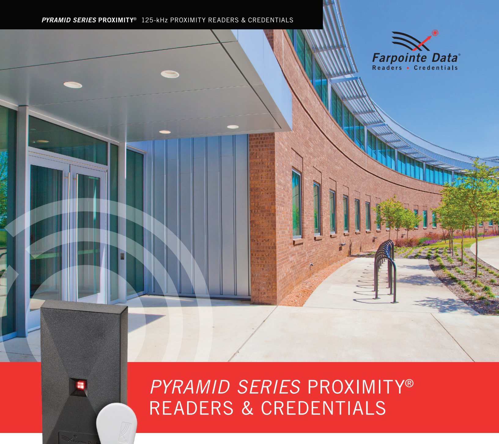
Pyramid P-300 Mullion Mount Proximity Reader with Key Ring Tag